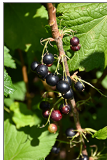
Consort Black Currant fruit

This is a dense multi-stemmed deciduous shrub with a more or less rounded form. Its relatively fine texture sets it apart from other landscape plants with less refined foliage. This plant will require occasional maintenance and upkeep, and is best pruned in late winter once the threat of extreme cold has passed. It is a good choice for attracting birds to your yard. It has no significant negative characteristics.