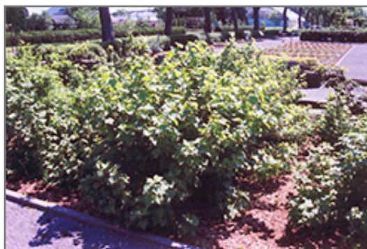
Consort Black Currant