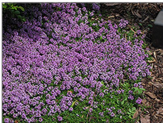
Purple Carpet Creeping Thyme in bloom