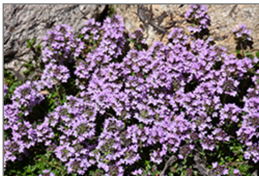
Purple Carpet Creeping Thyme flowers