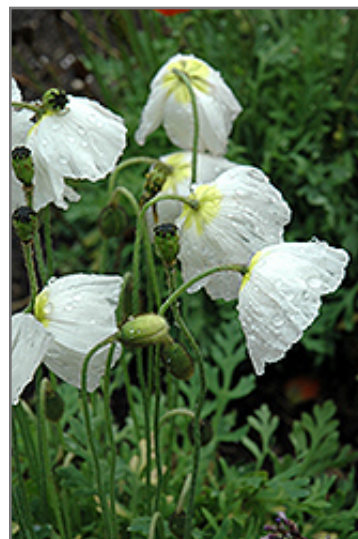
Summer Breeze White Poppy flowers