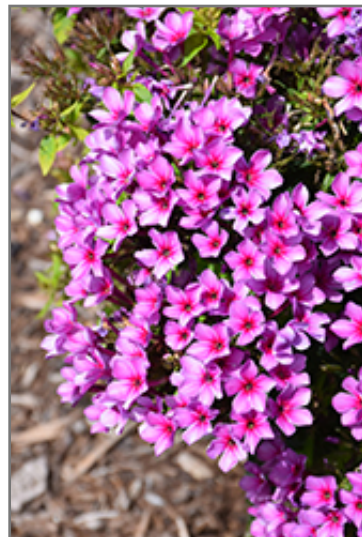
Early Purple Pink Eye Garden Phlox flowers