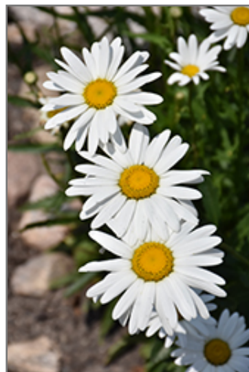
Silver Princess Shasta Daisy flowers