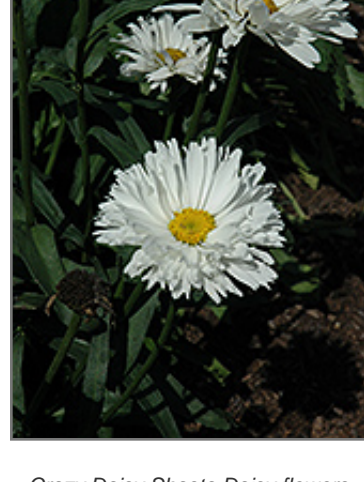
Crazy Daisy Shasta Daisy flowers