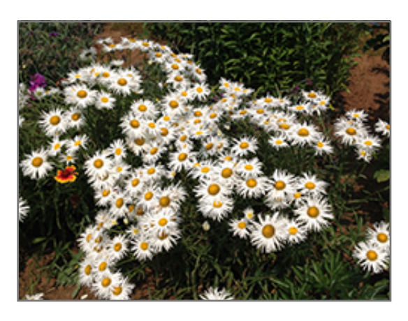
Crazy Daisy Shasta Daisy in bloom