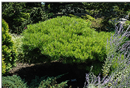
Low Glow Japanese Red Pine

Low Glow Japanese Red Pine is recommended for the following landscape applications;