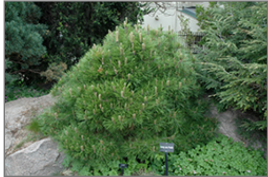
Low Glow Japanese Red Pine

This shrub should only be grown in full sunlight. It prefers dry to average moisture levels with very well-drained soil, and will often die in standing water. It is not particular as to soil type, but has a definite preference for acidic soils. It is highly tolerant of urban pollution and will even thrive in inner city environments. This is a selected variety of a species not originally from North America.